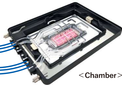
< Chamber >

Enables to deliver drug on each well of 8 wells