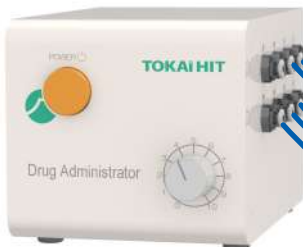
< Controller >